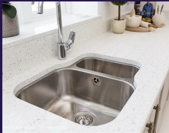
Fry Nansledan Show Home