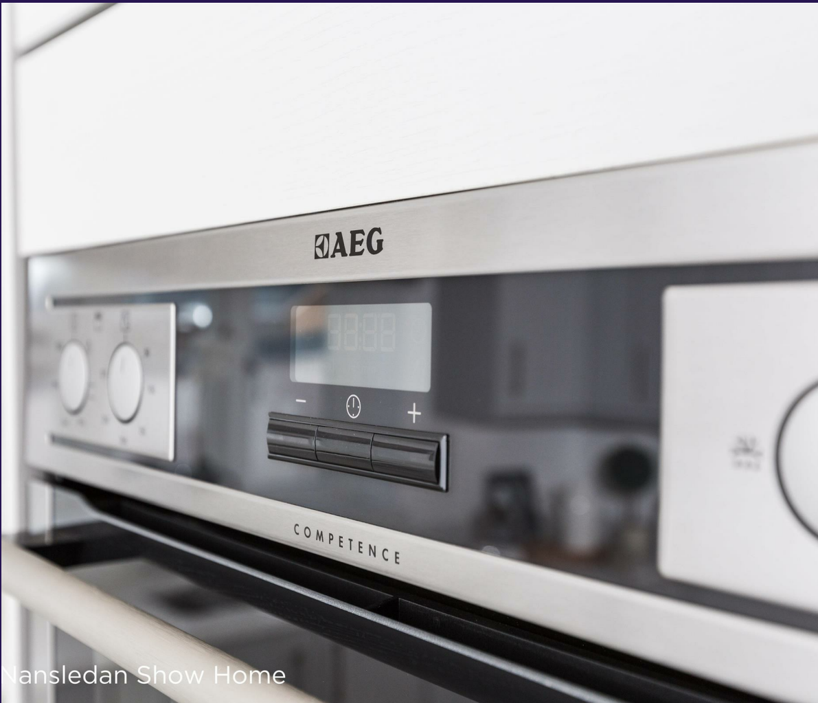
Nansledan Show Home