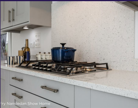
Fry Nansledan Show Home